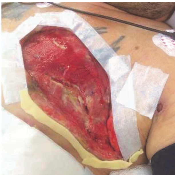
Figure 2 The patient underwent serial debridements and pleural cavity drainage. After surgical control of the necrotizing soft tissue infection, the chest wall wound healed well and was treated with a negative-pressure dressing changes. Here is a photo of the wound 5 days after initiation of wound vacuum assisted closure (VAC) therapy. There is extensive granulation tissue at the base of the wound and no residual necrotic tissue.

NSTIs are rare but serious infections associated with a significant morbidity and mortality. Despite improvements in the diagnosis and treatment, mortality remains high (16.9–29%). Early recognition and prompt surgical intervention decrease mortality. Factors that suggest a necrotizing infection include exquisite tenderness to palpation, marked erythema, crepitus, and bullae. Patients often manifest signs of sepsis and septic shock. Laboratory abnormalities include leucocytosis, neutrophilia, and hyponatremia.