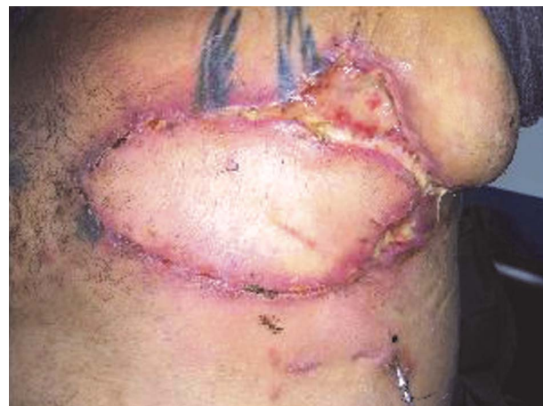
Figure 3 Two months after initial presentation. Left chest wall following reconstruction with a pedicled latissimus dorsi flap.

Few reports describe NSTI of the chest, most of which are due to penetrating trauma or chest tube placement. It is possible that this patients' infection originated from an infected hematoma or pneumonia, which expanded outward from the pleural space into the chest wall. The current literature cites an exceptionally high mortality after NSTI of the chest wall (60–89%). The higher mortality of chest wall NSTI is due to the impact of aggressive debridement on chest wall mechanics. Maintenance of chest wall integrity improves outcomes and should be attempted in order to allow proper ventilation and recovery.