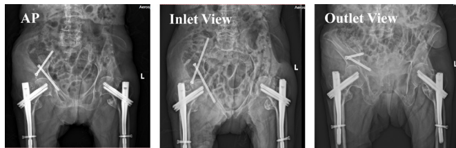
Figure 3 Postoperative images showed that the screws are in the correct position. AP, anteroposterior.

restore independent daily activities. 3 Notably, FFP typically arises from low-energy injuries. The fracture displacement is always limited as the ligaments around the pelvis in the elderly tend to be stronger than the bones, and the ligaments at the fracture site often remain intact after low-energy trauma. The treatment concept for FFP continues to evolve. Historically, FFP cases with minimal displacement were often managed conservatively, which requires prolonged bed rest, thus leading to respiratory, urinary, and other complications. After the introduction of the FFP classification system, Rommens et al 1 recommended conservative treatment for type I/II fractures, while advising surgical intervention for type III/IV and type II fractures that fail conservative treatment.