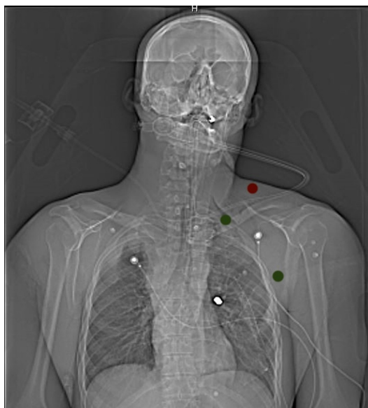
Figure 1 X-ray revealing a metallic fragment overlying the left hilum with depiction of the bullet wounds. There is one anterior wound in the left mid-supraclavicular region (red dot). Two left-sided posterior wounds are depicted with green dots with one in the superior mid-scapular region and another along the posterior midaxillary region at about the level of the third rib.

A patient in his 20s presented to our trauma bay after sustaining multiple gunshot wounds to the left thorax. Upon arrival, the patient was hypotensive with a blood pressure of 95/58 mm Hg, heart rate of 129 beats/minute, respiratory rate of 29 breaths/minute, and oxygen saturation of 94% on 10L non-rebreather. The patient was intubated for airway protection due to mentation and concern for his respiratory status. Focal assessment with sonography in trauma revealed a small anterior pericardial effusion. Initial chest X-ray showed a widened mediastinum and left hemopneumothorax with a bullet overlying the left hilum. Secondary survey and adjuncts created a puzzling picture. On the left side, the patient had three gunshot wounds in the mid-supraclavicular, superior mid-scapular, and posterior midaxillary regions (figure 1). Additional injuries included a left scapula fracture, left second and third rib fractures, and fractures of the anterior T1 and T2 vertebral bodies. On the right side, the patient had a palpable thrill at the right neck and supraclavicular region and was found to have a mid-shaft clavicle fracture and a large subclavian artery pseudoaneurysm with concern for active extravasation (figure 2). No injuries were identified