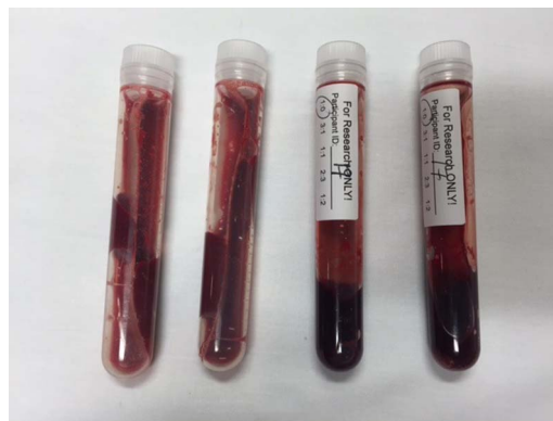
Figure 1 Examples of failed (two tubes, left) and intact (two tubes, right) clots after impact thromboelastometry.

Clots from WB and 75% blood failed in 17.3% and 33.3% of drops, respectively, while clots from 50%, 40%, and 30% blood failed 62.5%, 79.1%, and 3.8% of drops. Differences between WB and 30–50% blood were significant to p < 0.01 , as were differences between 75% blood and 30–40% blood.