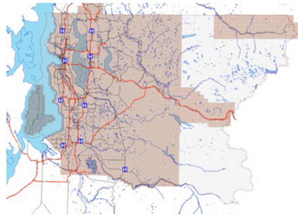
Figure 3 Geographic distribution of trauma centers in King County, Washington (central region).

This bill was passed into law as the Trauma Care Study Act of 1988 and called for the appointment by the Governor of a formal Trauma Care Steering Committee, chaired by Dr Jim Nania from Spokane, Washington. The committee was given the task of conducting a study of trauma care in Washington, developing a comprehensive trauma system plan and reporting recommendations to the Governor and legislature in January 1990, along with proposed implementation legislation. 4,5 The Steering Committee again included representatives of all the key EMS and trauma care provider groups in the state, statewide geographic representation and public representation. In addition to the committee, over 100 other interested experts within the state volunteered to participate in one of five technical advisory committees: data, prehospital, hospital, pediatric, and cost and public policy. The bill established a Trauma Trust Account funded for 2 years from the Public Safety and Education Account. This