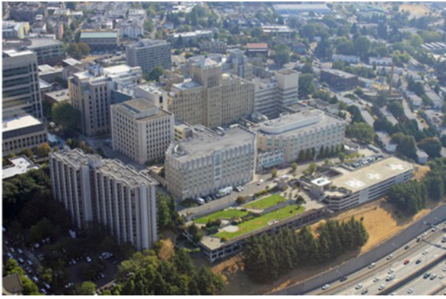
Figure 1 Aerial photo of the current Harborview Medical Center campus, Seattle, Washington.

heart surgery on the West coast was performed at Harborview by Alvin K Merendino, MD. 1