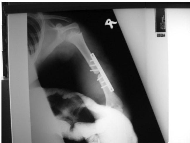
Figure 1 Day two postoperative X-rays of the right arm.

Amputations may be classified by the site of injury, type of injury (crush, sharp or avulsion) and degree of contamination and associated local injuries. 2 Amputations of the upper limb may be divided into major and minor depending on whether the amputated part has significant muscle bulk. 6 Major amputations are those at the level of the wrist or proximal, such as the index case. 6 The more proximal the amputation, the greater the muscle load 5,6 and muscle does not tolerate ischemia well. 5,6 Proximal amputations have poorer prognosis. 2,6,7 The major reason for poor outcomes of high-level reimplantation is difficulty in restoring nerve function. This may result in joint stiffness, joint instability, infection, skin and muscle necrosis. 7-9