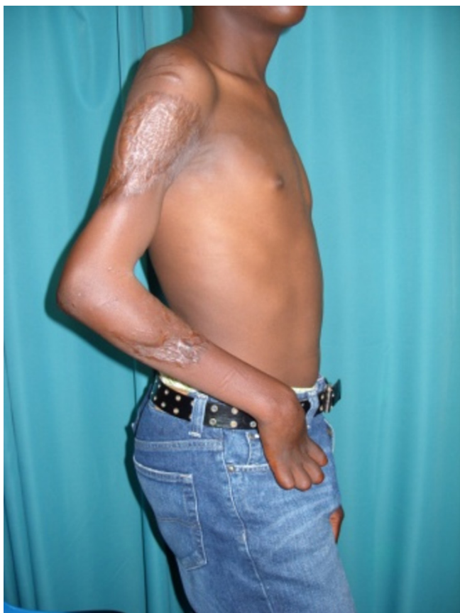
Figure 2 Lateral view of the patient 4 years postinjury.

Amputations may be classified by the site of injury, type of injury (crush, sharp or avulsion) and degree of contamination and associated local injuries. 2 Amputations of the upper limb may be divided into major and minor depending on whether the amputated part has significant muscle bulk. 6 Major amputations are those at the level of the wrist or proximal, such as the index case. 6 The more proximal the amputation, the greater the muscle load 5,6 and muscle does not tolerate ischemia well. 5,6 Proximal amputations have poorer prognosis. 2,6,7 The major reason for poor outcomes of high-level reimplantation is difficulty in restoring nerve function. This may result in joint stiffness, joint instability, infection, skin and muscle necrosis. 7-9