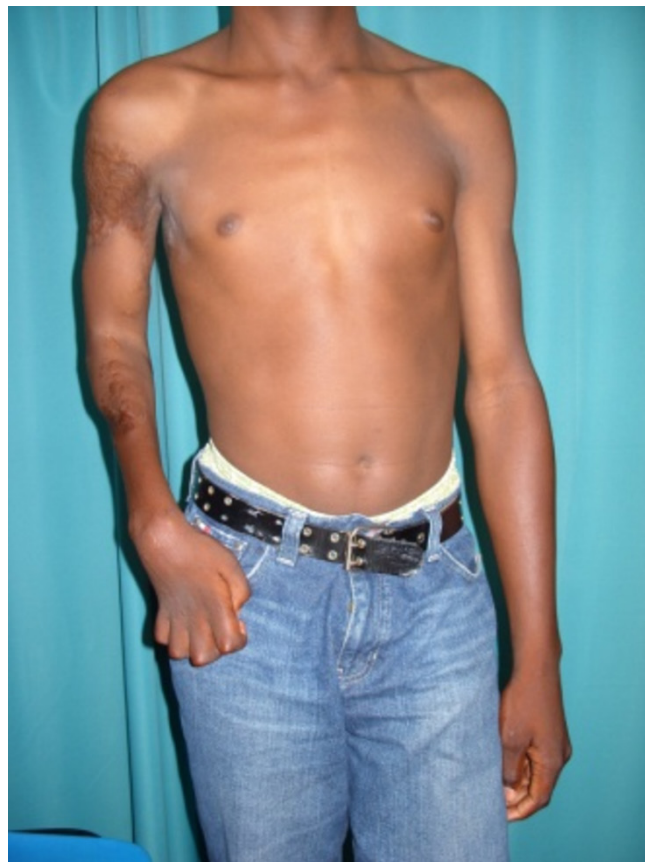
Figure 3 Anteroposterior view of the client 4 years postinjury.

Proximal amputations are also associated with an increase in the number of required secondary procedures. 6 The greater the time required for severed nerves to regenerate to the end plates, the worse the chances of recovery. 10 This factor also applies to children. 11 Saies et al 11 found that age did not affect functional outcome; however, children less than 9 years of age had a significantly higher rate of limb survival. 11