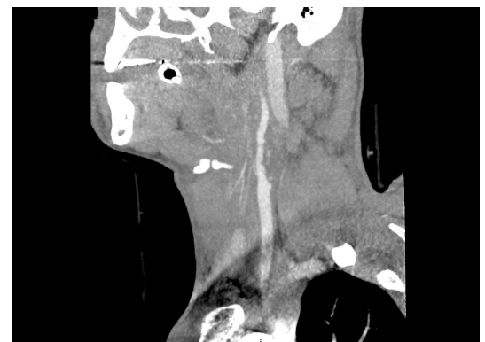
Figure 2 CT angiography on postoperative day 0 of the right neck demonstrating a patent external to internal carotid anastomosis with no flow-limiting stenosis to the intracranial circulation. The adjacent internal jugular vein is ligated.

To cite: Jensen AM, Dennis JW, Allmon JC, et al. Trauma Surg Acute Care Open 2018; 3 :e000182.