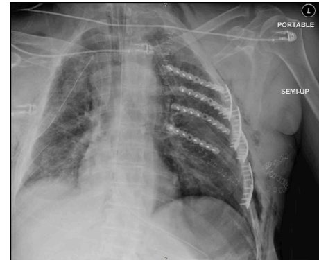
Figure 2 Postoperative chest X-ray demonstrating left chest wall reconstruction.

consistent with myocardial contusion and right atrial compression. His troponins were also significantly elevated. He required significant resuscitation with crystalloids, blood products and vasopressors. He underwent bronchoscopy, esophagram and upper endoscopy to exclude tracheoesophageal injury, and these were negative. On hospital day 2, the patient was hemodynamically stable, and pressors were discontinued. His pelvic fractures were repaired using external fixation and sacral screws. Given his extensive left flail chest, he underwent reconstruction of his left chest wall on hospital day 5. Open reduction and internal fixation of his left ribs, 3 to 6 anteriorly and 4 to 7 posteriorly, with titanium plates was performed (figure 2). He had an epidural catheter inserted for analgesia. On postoperative day 2 after chest wall reconstruction, the patient was extubated and resumed enteral feeds. Overnight, the output from the left-sided chest tube changed from serosanguinous to milky. A sample was sent for triglycerides and lymphocyte counts confirming the diagnosis of chylothorax. His chest tube output increased to approximately 2000 mL/day. A lymphangiogram was performed with Lipiodol to diagnose the location of the chylous leak. It revealed contrast extravasation at the level of T3 to T4. An MRI was also performed to better define the anatomic course of the thoracic duct.