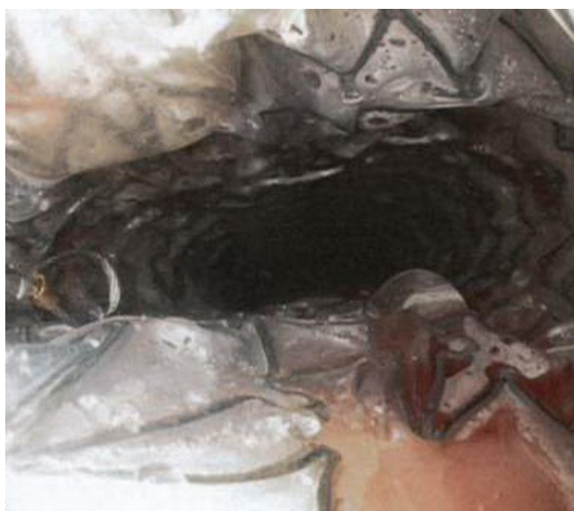
Figure 2 Esophageal stent covering area of injury.

Penetrating injury to the esophagus is encountered with relative infrequency and remains among the most challenging of wounds to manage while avoiding major postoperative morbidity. While early operative repair offers the best opportunity for success, it relies on sufficient exposure that may be technically difficult to achieve. In addition, although aggressive esophageal mobilization may improve exposure of the wound(s) requiring repair, such a maneuver may risk injury to the esophageal blood supply, resulting in devascularization. When situated at the thoracic inlet, injury to the esophagus is particularly troublesome as neither the cervical nor thoracic approach to the wound is particularly gratifying given the limited space in which to expose the injury.