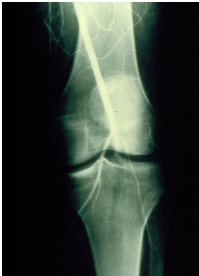
Figure 2 Blunt thrombosis of the left popliteal artery behind the knee joint.

After the non-injured distal popliteal artery and adjacent popliteal vein were encircled with vessel loops, the extent of arterial thrombosis was 6 cm in length. A longitudinal arteriotomy 4 cm in length was made in the medial aspect of the area of thrombosis. Fogarty balloon catheters #4 and #5 were passed proximally via partial loosening of the vessel loop, and no clot was removed from the superficial femoral artery. After removal of the #5 Fogarty balloon catheter, 20 mL of a solution of 50 units of unfractionated heparin/mL of saline was injected proximally, and the proximal popliteal artery was reclamped. In a similar