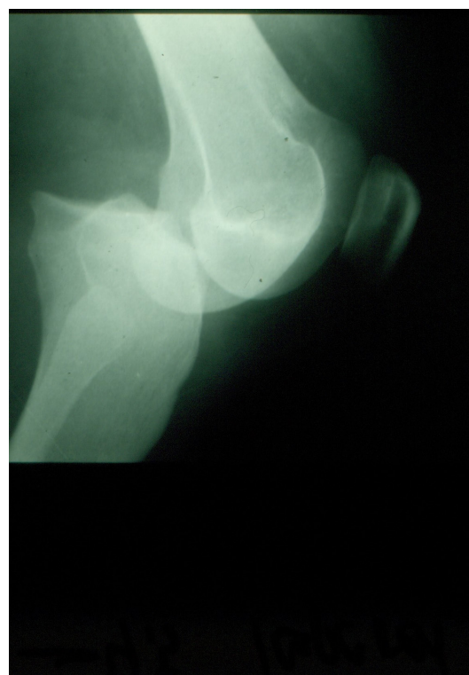
Figure 1 Posterior dislocation of the left knee joint.

prepared and draped from the umbilicus to the bilateral toenails, and the left foot was placed in a sterile transparent plastic bag. A 15 cm longitudinal medial popliteal incision was made, starting along the anterior border of the sartorius muscle in the medial distal left thigh, extending posteriorly to the posterior knee joint, and completed approximately 1 cm behind the posterior border of the proximal tibia. Care was taken to avoid the greater saphenous vein in the distal one-third of the incision. The proximal popliteal vessels were exposed by retracting the sartorius and gracilis muscles posteriorly and the vastus medialis anteriorly. As noted in Wind and Valentine, 1 the surgeon had to divide the attachment between the adductor magnus tendon from the semimembranosus muscle to visualize the popliteal vessels exiting the adductor hiatus. There was obvious thrombosis of the mid-popliteal artery (figure 3), and the proximal artery and adjacent popliteal vein were encircled with vessel loops. It became obvious that the extent of thrombosis mandated further exposure of the artery behind the knee joint. The tendons of the pes anserinus (sartorius, gracilis, and semitendinosus muscles) were then divided 1.5 cm from their distal bony attachments. Before each tendon was divided, the proximal and distal ends were marked with a colored suture, using different colors for each tendon.