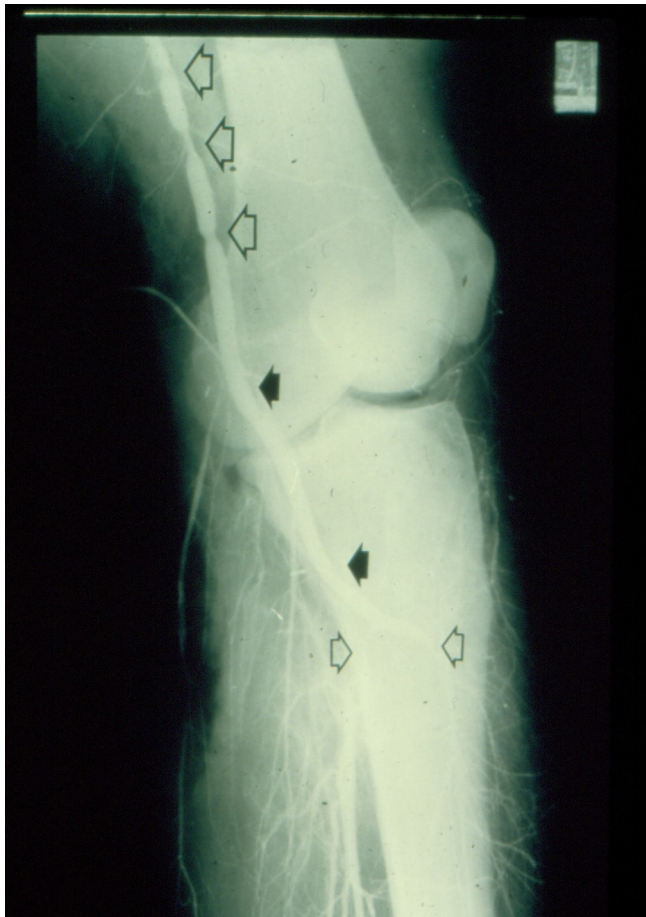
Figure 5 Post-repair arteriogram documents multiple vascular clamp marks (large hollow arrows), patent anastomoses (black arrows), and flow into the anterior tibial artery and tibioperoneal trunk (small hollow arrows).

and continue the oral baby aspirin dosage as described above for 3 months.