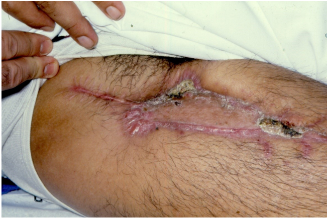
Figure 5 Healed split-thickness skin graft on 102nd day after injury.

orientation before passage through the new subcutaneous tunnel.