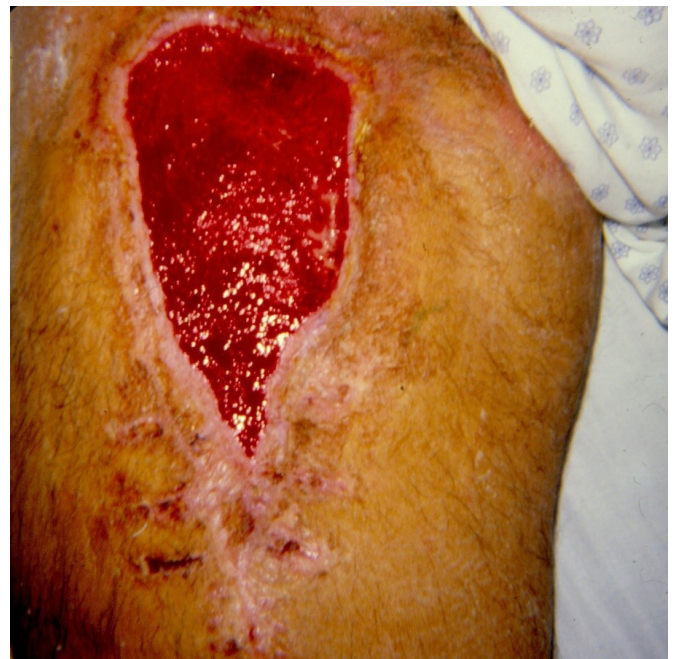
Figure 4 Soft tissue defect in the right thigh prior to application of a split-thickness skin graft.