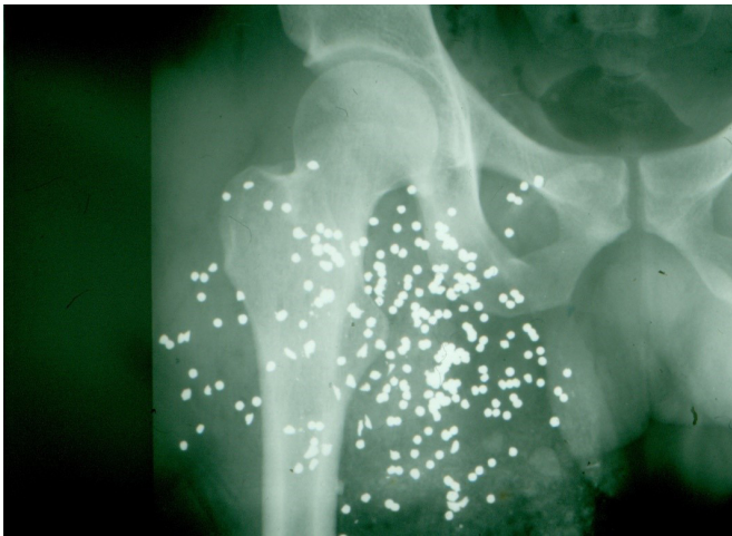
Figure 1 Shotgun wound to the proximal right thigh.

graft infections in the brachial, iliac, or femoral arteries. 2-12 The indications for an extra-anatomic bypass have remained the same over time as follows: (1) loss of soft tissue over injured artery or vein; (2) postoperative infection of the incision with blowout of underlying arterial repair; and (3) infections of both soft tissue and underlying native artery secondary to injection of illicit drugs.