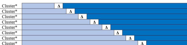
Δ = transition period from pre-intervention (usual care) to post-intervention *Cluster randomly chosen to transition from pre-intervention (usual care) to post-intervention

The design is commonly used in the evaluation of processes and models of care delivery in which individual randomization is problematic (table 4). The earliest and most widely known cluster randomized stepped wedge design study was the Gambia Hepatitis Intervention Study. 15 This study randomly selected geographic areas in Gambia every 12 weeks in which to roll out routine hepatitis B virus (HBV) vaccination with the goal of introducing HBV vaccination to the entire country in a 4-year period. This creates a group of HBV-vaccinated and a group of HBV-unvaccinated children during that 4-year period to compare long-term outcomes contemporaneously while also allowing all geographic areas to eventually cross-over into routine HBV vaccination. Long-term data collection on the effectiveness of