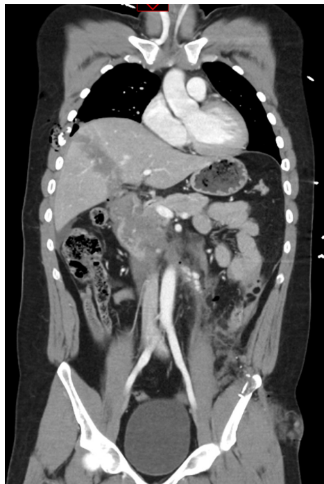
Figure 1 CT of chest and abdomen showing tract of the projectile.

allows for simultaneous therapeutic intervention. 6 Interestingly, it has also been shown that the use of urine dipsticks to detect bilirubin in sputum may aid in making the diagnosis. 8