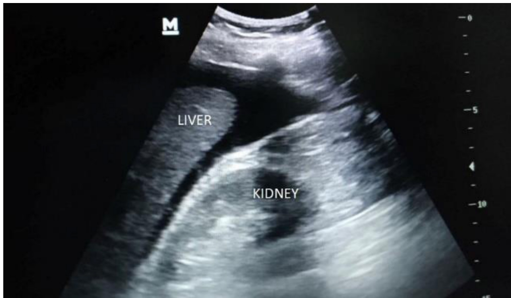
Figure 1 Ultrasonography (USG) showing blood collection on right upper quadrant view.

The median age of presentation was 39 years (range 18–95 years). The leading cause (n=116, 44%) of trauma cases was due to road traffic crash (RTC) followed by fall injuries (n=112, 43%). Approximately 23% of patients arrived at the ED within