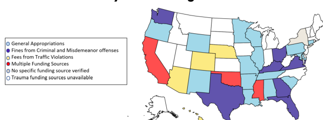
Figure 2 Categories of trauma system funding, by state.