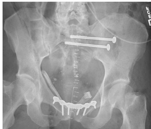
Figure 3 Postoperative X-ray demonstrating operative pelvic fixation with anterior pubic symphyseal plating and left sacroiliac screw placement.