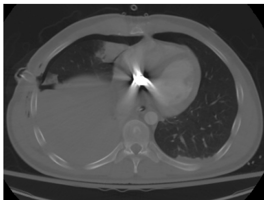
Figure 2 Chest CT with lung window showing ballistic fragment in the right atrium at the atrioventricular junction/valve, no pericardial collection, and a collapsed inferior vena cava.

emboli require extraction. For asymptomatic patients, there is debate between expectant versus operative removal, and open versus endovascular techniques. In our case, the patient was hemodynamically unstable with continued transfusion requirements, tricuspid regurgitation and the possibility of further