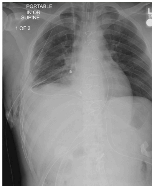
Figure 3 Postoperative CXR after median sternotomy with removal of bullet fragment. Two small bullet fragments remain projecting over the right cardiac border.

embolization to the pulmonary vasculature, which prompted surgical exploration. Due to the location of the bullet, in the tricuspid leaflet, a sternotomy with arteriotomy was the ideal approach.