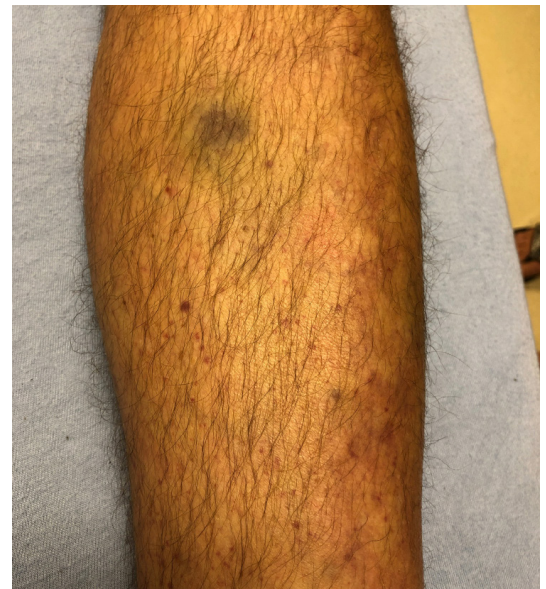
Figure 1 Lower extremity petechiae and ecchymoses at time of initial presentation.

Rituximab reduces the number of B cells producing antiplatelet antibodies, thereby raising platelet counts. The short-term response rate for rituximab is approximately 60%, with approximately 25% of patients maintaining a durable rise in platelet count at 5 years. TPO-RA therapies induce platelet production by activating TPO receptors on megakaryocytes. Approximately 30% of patients maintain a sustained durable response in platelets after tapering TPO-RA therapy, while others require long-term TPO-RA therapy. Splenectomy removes the primary site of platelet clearance and autoantibody production and has the highest rate of durable response (60%–70%) compared with other ITP therapies. Patients with a strong desire to avoid surgery may prefer a TPO-RA or rituximab. Patients who value achieving a durable response may prefer splenectomy.