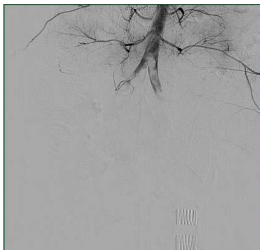
Figure 1 Angiography demonstrating obstructed flow at the level of the common iliac arteries bilaterally.

Due to the complexity of his injuries, he was transferred to a level one trauma center where his examination was notable for a large left groin wound with gross feculent contamination. He had significant left thigh and perineal degloving and absence of bilateral lower extremity pulses. His right upper extremity remained with a tourniquet in place above the elbow, and nearly complete amputation distally. The patient was taken immediately to the operating room where he was found to have ischemic left colon and rectum, perineal degloving, and avulsion of the bladder dome. He sustained catastrophic disruption of his pelvic ring including spinopelvic dissociation, severe comminuted fractures throughout the entire left innominate bone, and complete dissociation of the right hemipelvis (figure 2). All bone was dysvascular. There were no viable targets for revascularization of the right lower extremity. The right upper extremity was ischemic and not viable distal to the tourniquet, which had been in place for greater than 6 hours.