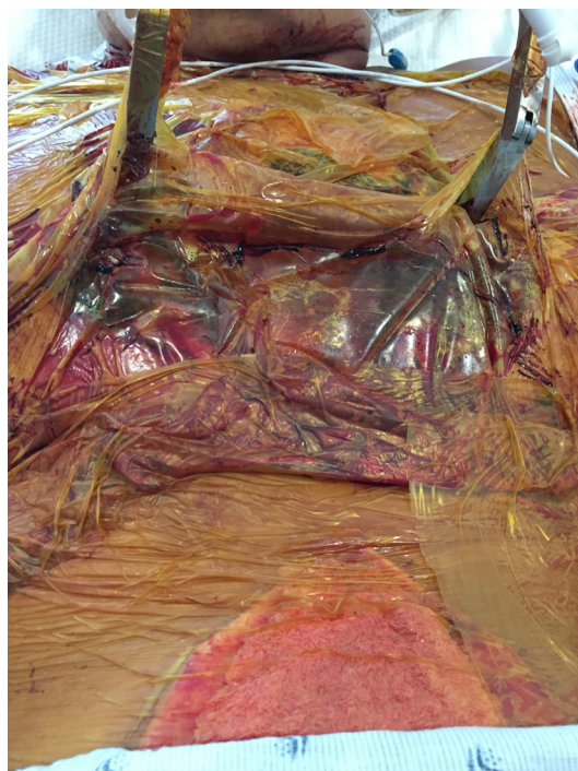
Figure 1 The sternotomy wound with a stay sternal retractor and an occlusive dressing.

cells, rationed with fresh frozen plasma and platelets. She became coagulopathic, hypothermic, and acidotic due to the profound hemorrhage and the complexity of multi-trauma. The heart, lungs and chest wall were tremendously edematous. When the sternotomy incision was approximated, she became severely hypotensive.