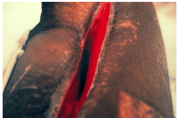
Figure 4 Granulating open left groin wound at time of discharge on 39th postinjury day.

The choice of a small size PTFE graft for the extra-anatomic bypass would be criticized by most vascular trauma surgeons in the current era. The first reason is that PTFE prostheses are