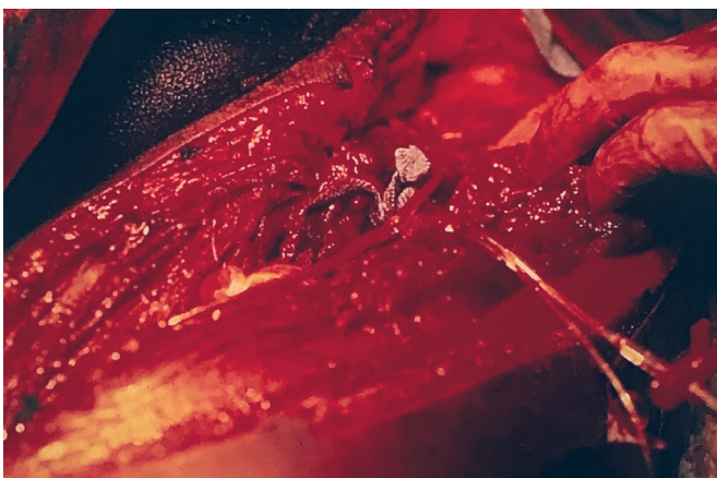
Figure 2 Pruitt-Inahara intra-arterial shunt connecting left common femoral and superficial femoral arteries in groin wound.

The fundamental principles of ‘damage control’ for vascular trauma were all applied in this patient. 7 First, bleeding from