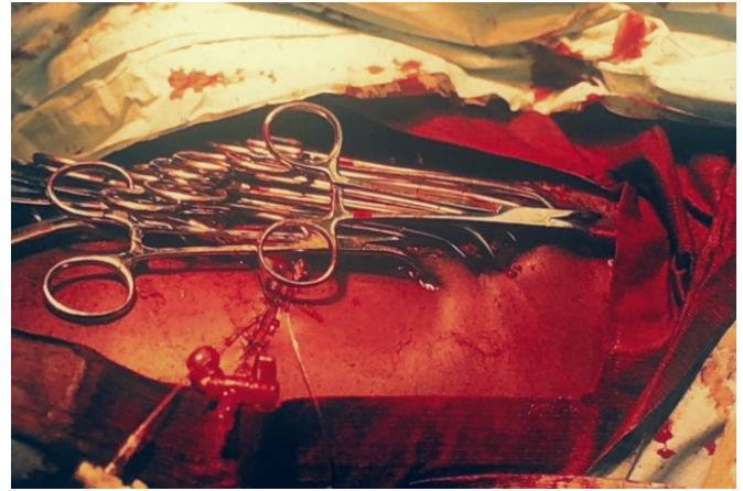
Figure 3 Towel clip closure to cover open left groin wound and shunt except T-piece.

multiple pellet wounds was controlled by resection of an injured segment of a major artery (CFA/SFA) and ligation of a major vein (CFV). Second, after passage of Fogarty balloon catheters proximally and distally, a temporary intraluminal shunt was inserted to restore arterial inflow into the extremity. Third, with edema of the left lower extremity from ischemia and ligation of the CFV, a ‘prophylactic’ (no compartment pressure measured) two-skin incision four-compartment fasciotomy was performed in the left leg. 8 And, fourth, a temporary towel clip closure of the defect in soft tissue/incision in the left groin was performed to cover the intraluminal shunt.