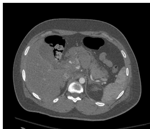
Figure 2 Axial slice of the CTA abdomen of the ruptured hepatic artery pseudoaneurysm.

A REBOA was placed in the intensive care unit and he was emergently taken to the OR for an exploratory laparotomy. A large, peripancreatic hematoma precluded dissection of the common hepatic artery origin. Furthermore, the celiac axis was known to originate from behind the pancreas on his preoperative imaging. Once the area was packed, the REBOA was deflated and the site