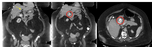
Figure 1 Multiple cuts of the CT scan showing gastric outlet obstruction caused by a large gallstone in the duodenum (red circle) with associated pneumobilia (yellow arrow).

While minimally invasive approaches to foregut and biliary surgery are becoming increasingly predominant, the extent of inflammation appreciated on imaging as well as the significant anatomic distortion caused by the disease process were factors favoring an open approach to safely maximize visualization. After discussing these