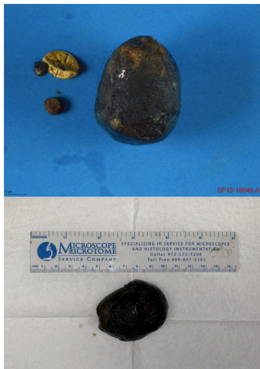
Figure 3 Gross images of the 5.5 cm gallstone extracted intraoperatively from the duodenum.

considerations among all members of the surgical team, the patient subsequently underwent an exploratory laparotomy. The duodenum was found to be densely adherent to inferior edge of the liver. Traction sutures were placed at the superior and inferior margins of the pylorus, and an anterior gastrotomy was created, extending across the pylorus by 2 cm in either direction. The large 5.5 cm stone was extracted carefully to avoid future distal obstructions from fragmentation ( figure 3 ). A nasojejun tube for early enteral nutrition and NGT for decompression were placed under direct visualization.