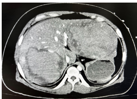
Figure 1 Axial CT image showing the large bilateral hepatic adenomas.

On clinical presentation, the patient was hypotensive at 90/60, tachycardic, and had a hemoglobin of 4.8 and a lactate of 11.66. Her abdomen was peritonitic on examination. Immediate management included resuscitation with fluids and blood to manage her hypotension.