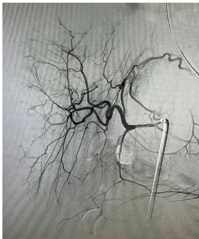
Figure 3 Angiography did not reveal any active contrast extravasation.

Alexandra MacHugh http://orcid.org/0000-0001-5465-0904