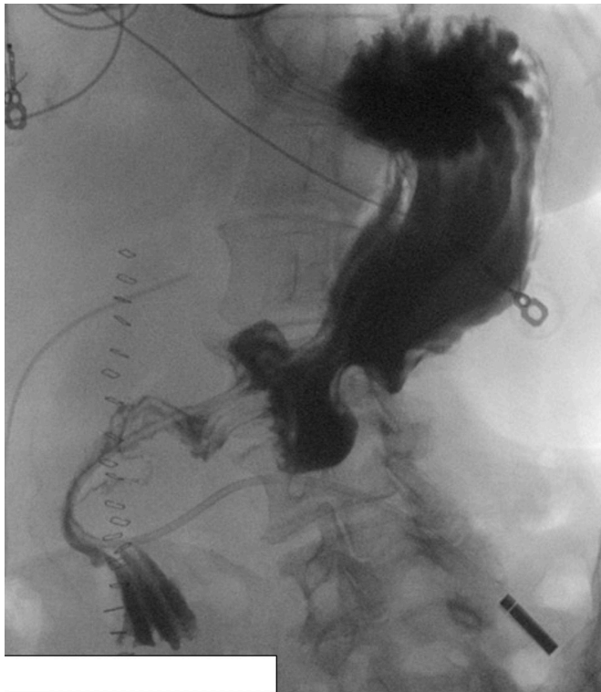
Figure 3 Upper gastrointestinal study.

patient's presentation, physiology, and location/size of the abnormality.