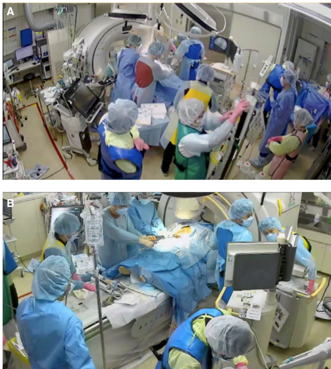
Figure 2 (A,B) The pictures of actual REBOA insertion scenes for pelvic trauma patient. And after the placement of REBOA, we rapidly implemented laparotomy on this bed for the concomitant intra-abdominal bleeding without patient transfer. REBOA, resuscitative endovascular balloon occlusion of the aorta.

without patient transfer, offer the potential for innovation of bleeding control strategies, algorithms, and time processes for managing pelvic trauma. 8,9