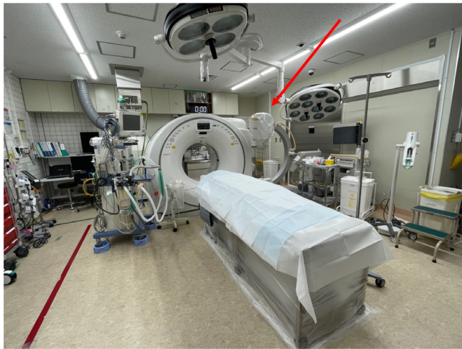
Figure 1 Overall view of the CTCARM. The patient resuscitation table is combined with a 64-helical CT scanner and C-arm fluoroscopy (red arrow). This system allows us not only to perform CT scanning but also emergency surgery, including thoracotomy and laparotomy, without transferring the patient. Although C-arm fluoroscopy is not the resolution required for interventional radiology procedures, we can perform essential cannulation of arteries or veins with the guidance of this fluoroscopy system. CTCARM, CT and C-arm combined resuscitation room system.

without patient transfer, offer the potential for innovation of bleeding control strategies, algorithms, and time processes for managing pelvic trauma. 8,9