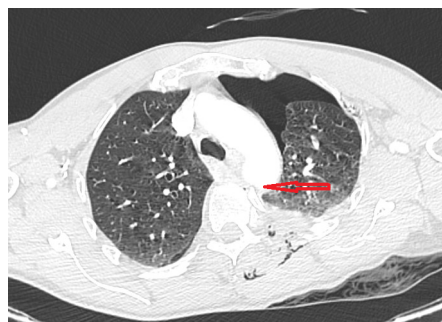
Figure 1 Initial CT scan with rib fragment compressing the posterior wall of the aorta.

After initial chest drainage, we repeated a CT scan and there were still signs of the fourth and fifth ribs compressing the posterior wall of the aorta. We decided to perform thoracotomy and rib resection of the posterior fragments of the fourth and fifth ribs that were in close contact with the aorta. Stielle-Giertz rib shares were very useful for resecting posterior rib fragments. Anterior fractures