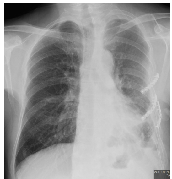
Figure 3 Chest radiography before discharge, showing plated anterior parts of fractured ribs.

of the fourth, fifth, and sixth ribs were stabilized using three metal plates. Due to the spinal injury, we used a surgical approach through left anterior thoracotomy with the patient in the supine position. Reduction and stabilization of posterior fragments of the fourth and fifth ribs would have demanded a decubital position, and in our case, that position was limited due to vertebral injury. Also, the posterior rib fracture was very close to the vertebra. Four days after the thoracotomy, L4 vertebral and right bimalleolar fractures were stabilized by orthopedic surgeons. Two weeks after thoracotomy, signs of thoracotomy wound infection and pleural effusion accumulation were registered on the left side on the