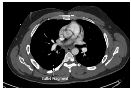
Figure 2 CT angiography cross-section showing bullet fragment embolized to right lung.

Because the patient was hemodynamically normal, had normal ABIs, and had no evidence of expanding hematoma, we observed the patient in the ICU and obtained an arterial duplex. This demonstrated no arterial injury, but femoral vein thrombosis was identified. The patient's spinal cord injury and clinical examination were suspicious for cauda equina syndrome, and neurosurgery recommended against anticoagulation. Given the femoral vein thrombus and neurosurgical recommendation, an inferior vena cava (IVC) filter was placed. The patient's pulse