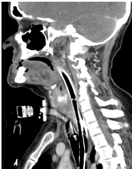
Figure 1 CT scan of patient's iatrogenic tracheoesophageal fistula on arrival. *Marks tracheostomy that enters the esophagus. **Marks the endotracheal tube that traverses the esophagus and enters the trachea.

After discussing the patient's problems with family, they felt the patient would want continued aggressive care and an opportunity to recover, so we tailored the patient's care toward that goal rather than palliation. Given its proximal location, thoracic surgery felt that endoscopic stenting would be unsuccessful, and it was our impression that a TEF repair would be most likely to succeed with a traditional interposed muscle flap. The following day, the patient was taken to the operating room where an incision was carried over the anterior border of the left sternocleidomastoid (SCM) which was mobilized off its' cranial attachments in preparation for a rotational flap. Next, a median sternotomy was performed, and the left tracheoesophageal groove was exposed. The esophagus was encircled with a penrose drain, and a 5 cm defect in the anterior esophagus identified that communicated with the posterior trachea below the angle of Louis, with the endotracheal tube (ETT) visible through the tracheal defect ( figure 2 ). The original tracheostomy tube was removed and after pre-oxygenating, the oral ETT was removed and an armored ETT placed through the tracheostomy tract directly into the trachea with the balloon at