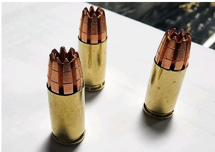
Figure 1 G2 Radically Invasive Projectile ammunition.

Though it appeared the life-threatening injuries had been addressed, the patient continued to have ongoing bleeding from the left thoracostomy. The midline laparotomy was extended across the costal margin into a left anterolateral thoracotomy. There was no hemopericardium, but numerous lacerations were evident along the parietal pleura along the spine, and there were multiple intercostal vessel lacerations. Hemorrhage control was achieved