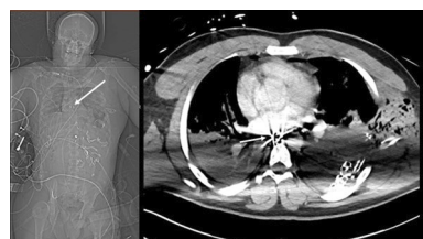
Figure 4 Torso CT. Arrows indicate radiopaque foreign body in proximity to the esophagus.

Two reports of the G2RIP round have focused on relevance to the trauma surgeon. In both prior reports, as in this report, damage control surgery was required because of the complexity of the injuries and severe physiologic derangement of the victims. Additionally, torso CT was performed after the first trauma operation to fully understand the extent of the injury and prepare for the next operation. A third common characteristic of the G2RIP round is the involvement of multiple body regions. Our patient had thoracic and abdominal involvement, as was reported by Hakki et al. 5 Iverson et al reported abdominal and proximal lower extremity involvement. 6 Although cavity penetration of the trocars depends on impact location, tissue composition, and ballistic variables, it is worth noting that the trocars do have the potential to cause massive organ damage in multiple cavities.