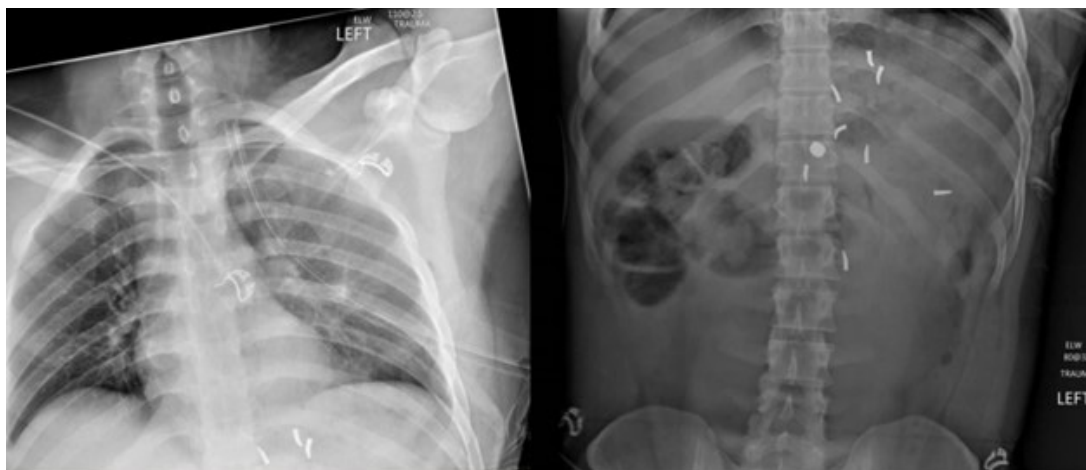
Figure 2 Chest and abdominal plain radiograph.

with suture ligation. No aortic or esophageal laceration was encountered. After surgical hemorrhage control was achieved, a temporary closure was performed, and the patient underwent CT imaging. CT showed foreign bodies scattered throughout the torso, including in proximity to the esophagus (figure 4). No new injuries were identified on CT. The following day, the patient returned to the operating room where they underwent esophagogastroduodenoscopy revealing foreign bodies but no esophagotomy or new gastrotomy. The patient's chest and abdomen were partially closed. At a third and final laparotomy, distal pancreatectomy was performed for a saponified, injured distal pancreas, as well as colon anastomosis and diverting ileostomy. The patient's postoperative course was complicated by the development of an abdominal abscess requiring percutaneous drainage. The patient was discharged home on hospital day 31.