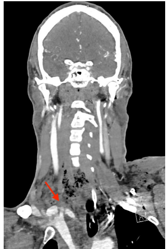
Figure 2 CT angiography coronal section showing a large pseudoaneurysm measuring 2.5x2.22 cm with probable extravasation.

in the abdomen or pelvis. After resuscitation and two units of whole blood in the trauma bay, blood pressure improved to 162/85 mm Hg.