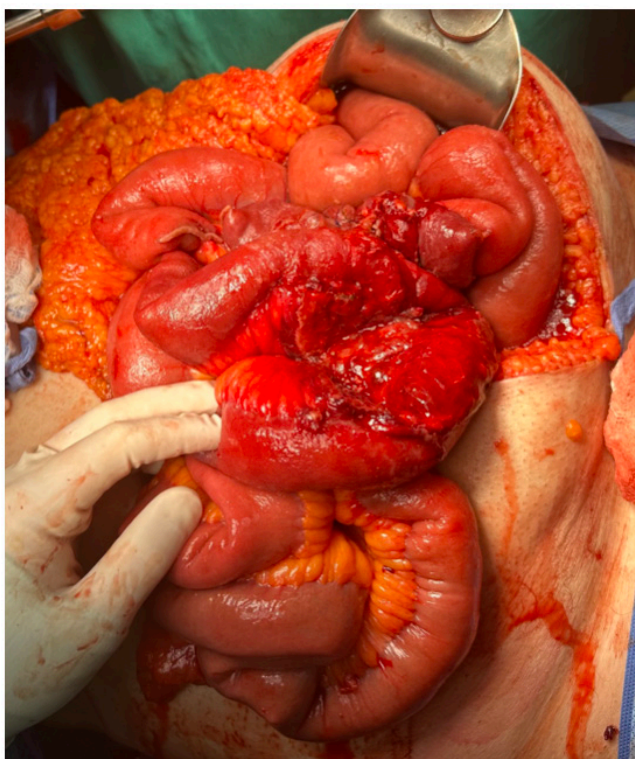
Figure 2 Remaining small bowel that was densely adhered to the abscess cavity.

The patient recovered well postoperatively. His blood pressure fell to 110/70 several hours after surgery, however, increased back to a hypertensive range over the next few days. He had an ileus and a low volume pancreatic leak that resolved prior to discharge on postoperative day 9. The 24-hour urine metanephrines came back elevated at 2.5 (reference <1.3 \mu\text{mol}/\text{day} ) and normetanephrines 44.3 (reference <4.3 \mu\text{mol}/\text{day} ). Relevant