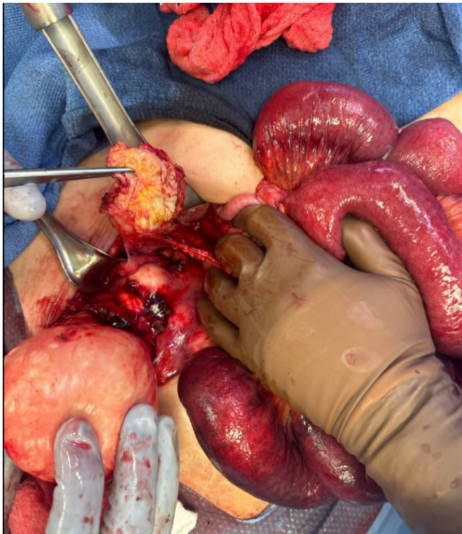
Figure 3 Right pelvic sidewall mass being excised.

with an open approach as the bulk and shape of the fibroid uterus limited pelvic domain, resulting in a limited xyphoid-to-umbilicus distance, and restricted any lateral uterine movement that would facilitate a laparoscopic hysterectomy.