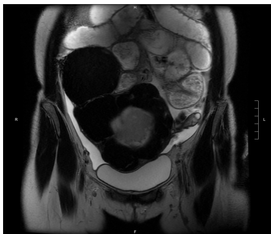
Figure 1 Pelvic MRI showing chronic ileus and delayed fecal transit likely secondary to mass effect from the large fibroid uterus with pelvic inflammation and peritonitis.

Gastrografin challenge showed delayed transit of contrast reaching the descending colon. On hospital day 2, the patient was still clinically obstructed. The patient did not desire future fertility and had no prior abdominal operations.