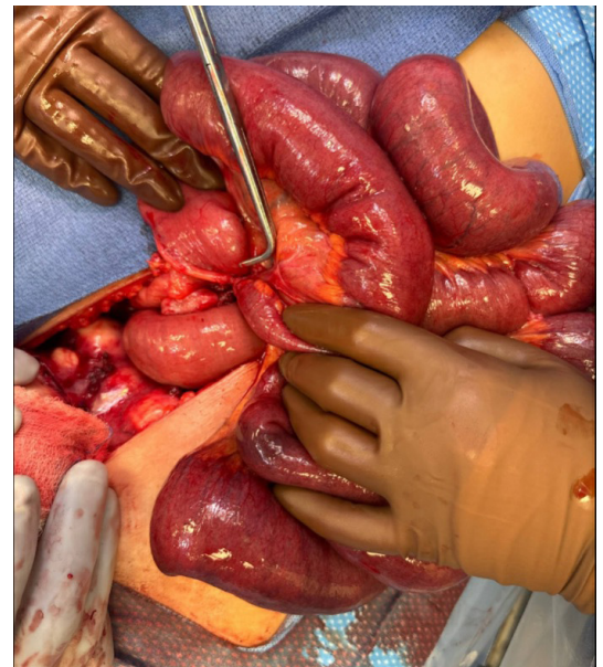
Figure 2 Adhesion causing closed loop small bowel obstruction.